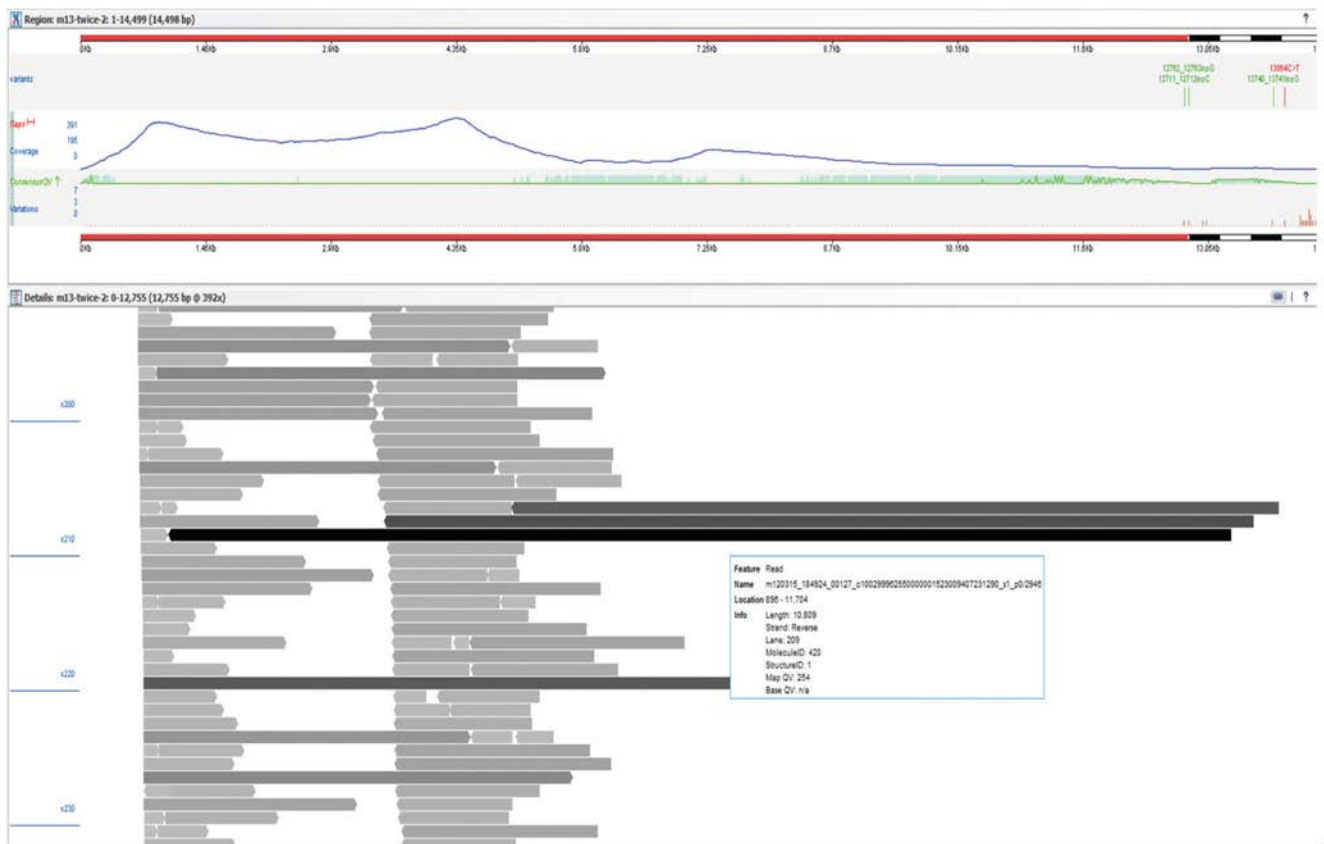
Figure 2. SMRT View genome browser, showing sequence data mapped against M13mp18 A single >10 kb read, longer than the entire M13mp18 circular genome, is highlighted.